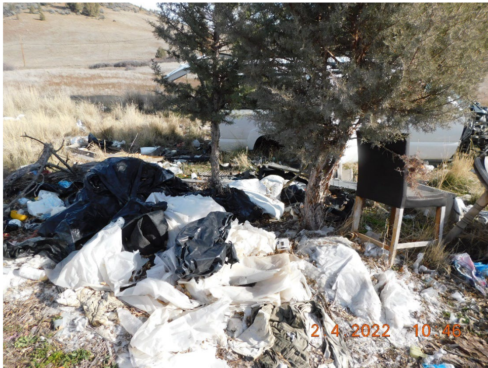
Figure 5: Facing West