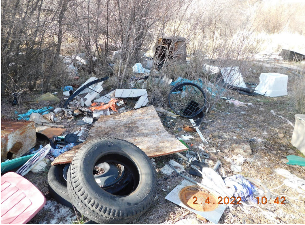
Figure 2: Facing Northwest