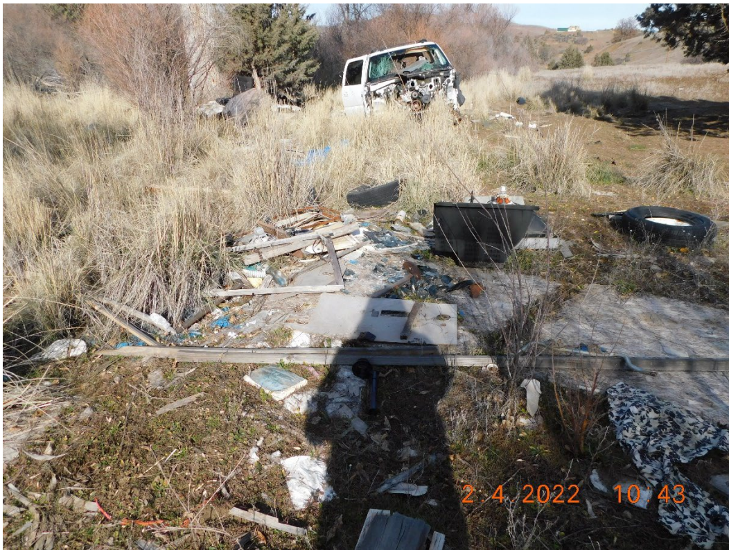
Figure 3: Facing West