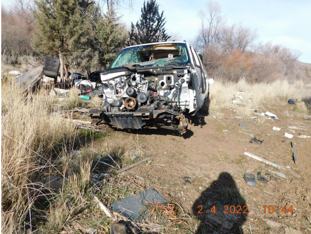
Figure 4: Facing North